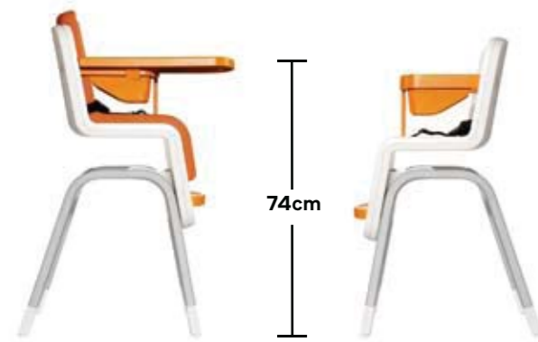
matches average table height