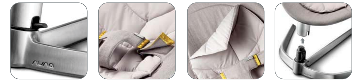
motion lock rock safe base